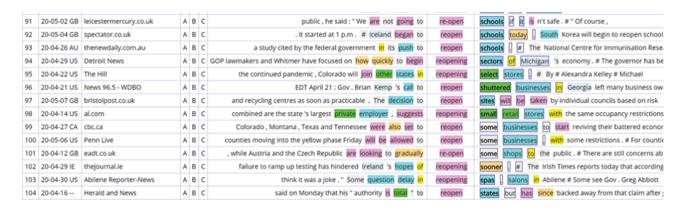
Figure 12. KWIC lines for re*open* in April-May 2020

then in about June 2020, the discourse changes to having people actually wear the masks that they already have (wear, worn, requiring, require, recommended, encouraged).